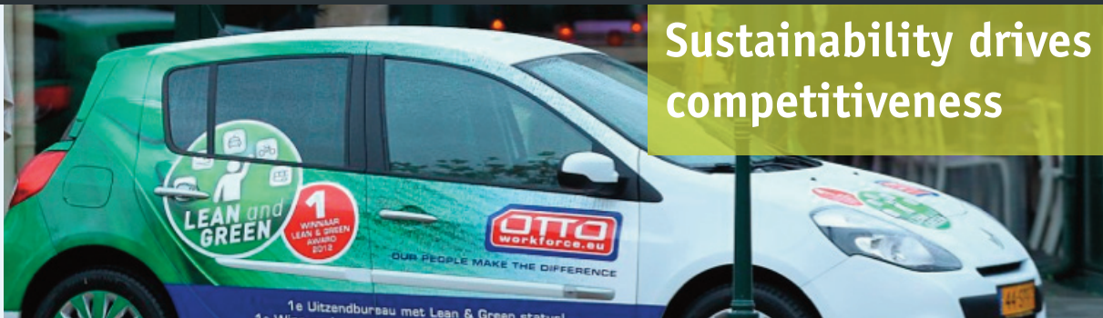
First employment agency with a Lean and Green Personal Mobility Award: Otto Workforce, November 2012