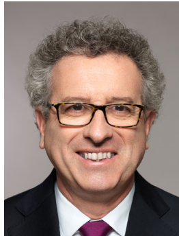
Pierre Gramegna, Minister of Finance