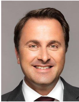
Xavier Bettel, Prime Minister

For all these reasons, we are convinced that Luxembourg is the right choice. We understand that other considerations such as the geographical spread might also play a role in the decision making process. However, we firmly believe that as a European capital and the host to judicial and financial institutions of the Union since 1965, Luxembourg stands out as the natural choice for the relocation of the European Banking Authority.