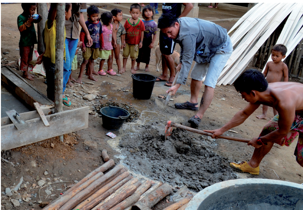
◀ Household Sanitation Facilities Pak Beng district, Oudomxay province