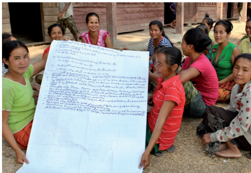
◀ VDP process- Women's priority list, Phaeken village