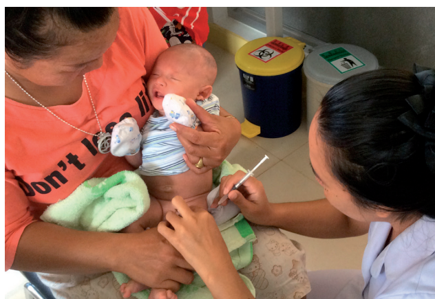
◀ Vaccination at Pakkading health centre